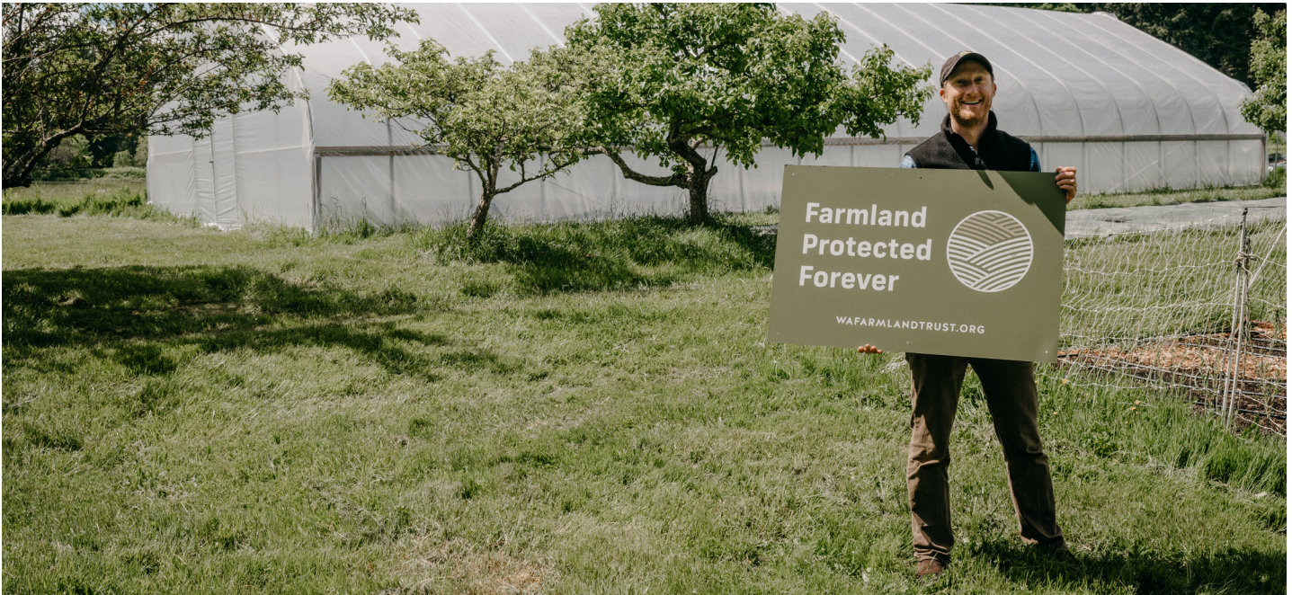
Washington Farmland Trust

OGC's success is directly linked to the partnerships, friendships and the communities where our coworkers, growers and customers live, and to the organizations working on causes we believe in. Throughout the year, we donate fresh organic produce and a portion of net profits to nonprofits that advance organic agriculture, food and farming education, environmental and community health, and sustainability and food equity.