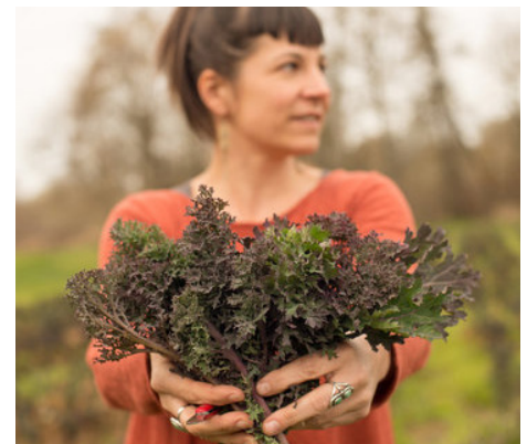
Culinary Breeding Network