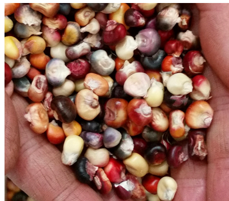
Organic Seed Alliance