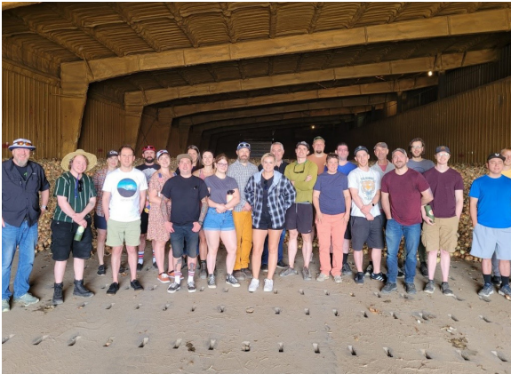
Inside Anderson Organic's massive onion-curing facility.

From arid Eastern Washington to the verdant Willamette Valley and locations in between, OGC hosted retail customers large and small on excursions to meet a handful of our esteemed growers. Starting with sweet and delicious organic melons and concluding with quince, this series of visits highlighted the incredible depth and breadth of summer offerings in the Pacific Northwest and a diverse collection of growers, all contributing to the organic movement in their own way.